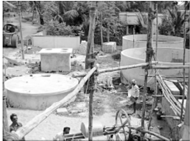
Fig 3 Water tanks RWS — Panchayat Raj Department, Andhra Pradesh, in Portland: Fal-G

regard to origin, sources, properties, application, past performance, cost issues, design and construction. The following are some of the codal references of the Indian Rule Congress, New Delhi.