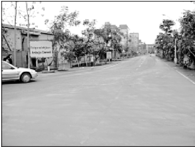
Fig 2 HVFC road in Ropar

This work establishes the scope of fly ash blends for prestressed concrete also with superior engineering performance, which is considered as critical application to demonstrate efficacy of concrete.